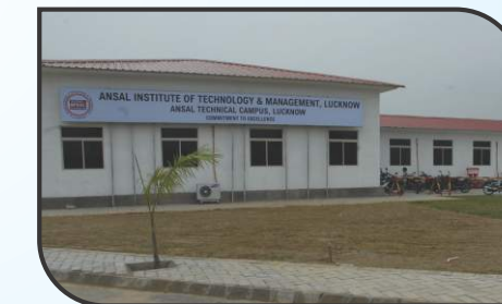
Actual picture of Ansal Institute of Technology & Management (AITM)