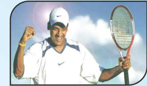
Mahesh Bhupati Tennis Academy