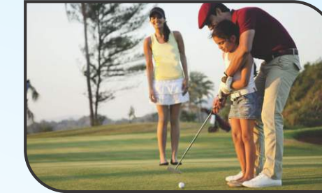
18 hole International Standard Championship Golf Course