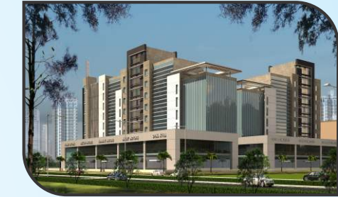
Ansal API Auto Park (launched)