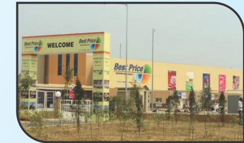
Actual picture of Best Price (Wholesale) A Bharti Walmart Venture (operational)