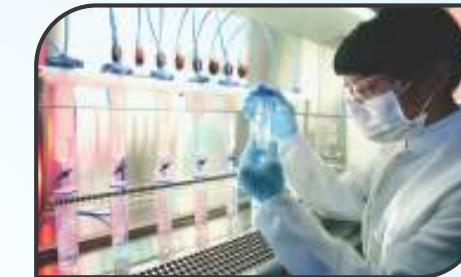
Bio-tech Park (Proposed)