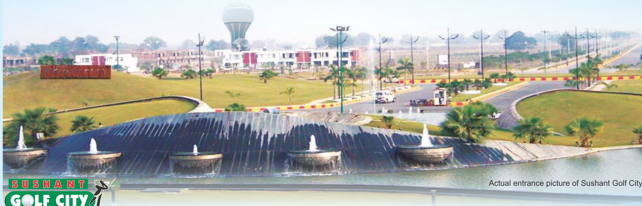
Actual entrance picture of Sushant Golf City

Ansal API is focusing on ushering in new realty and other infrastructure ventures in cities like Chandigarh, Bhatinda, Mohali, Amritsar, Ludhiana, Jalandhar, Jaipur, Jodhpur, Ajmer, Bhilwara, Sonapat, Panipat, Yamunanagar, Karnal, Kurukshetra, Faridabad, Gurgaon, Greater Noida, Noida, Ghaziabad, Meerut, Agra and Lucknow to name a few.