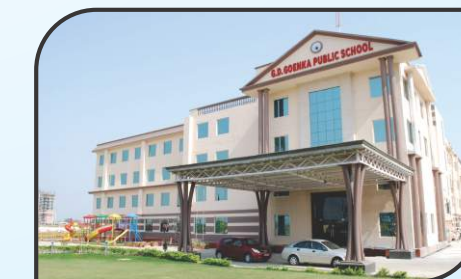
Actual picture of G.D. Goenka Public School