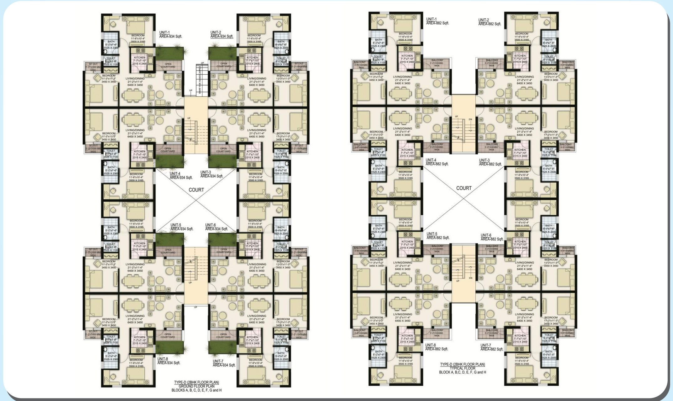
Unit Plan (2BR)