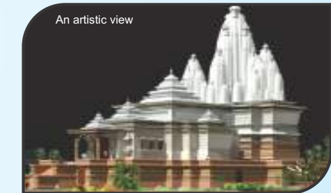
An artistic view