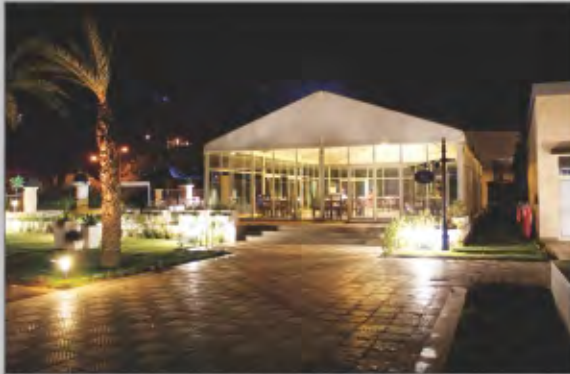
The Palms Golf Club and Resorts