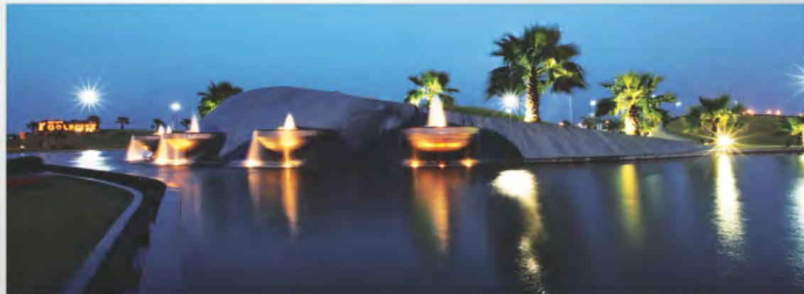
Actual picture of entrance

After successfully completing 11 years in Gurgaon, Ansal Institute of Technology & Management (A.I.T.M) is operational in Sushant Golf City, Lucknow.