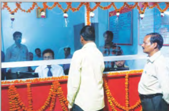
Sub Post Office