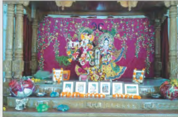
Ansal ISKCON Spiritual Center