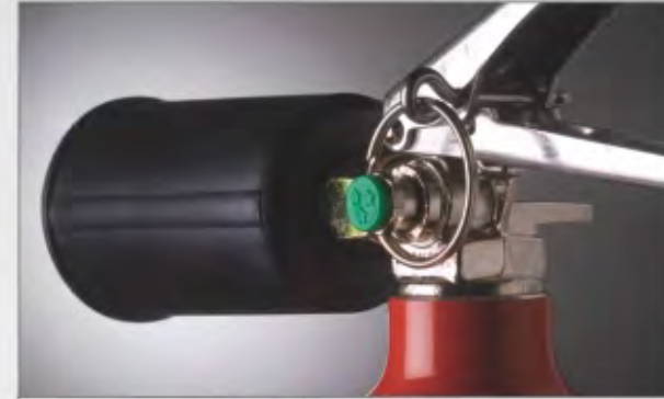
Fire safety provisions