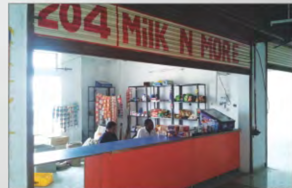
Milk 'N' More Shop