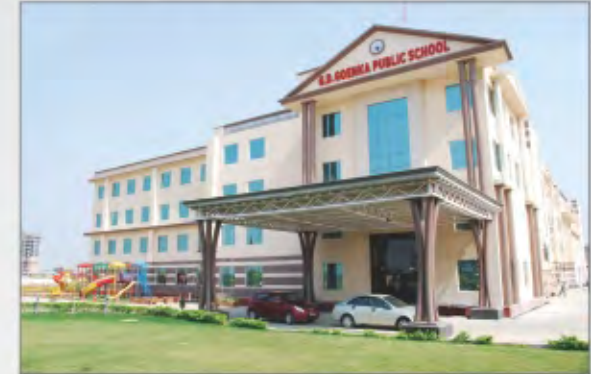
G.D. Goenka Public School