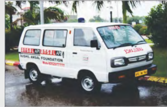
24X7 Ambulance Service