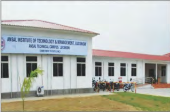
Ansal Institute of Technology & Management