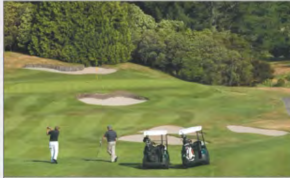
18 holes International standard championship Golf Course