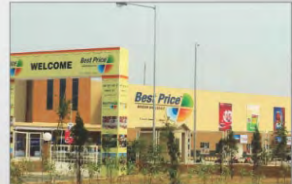
BEST PRICE-Joint Venture with Bharti & Walmart