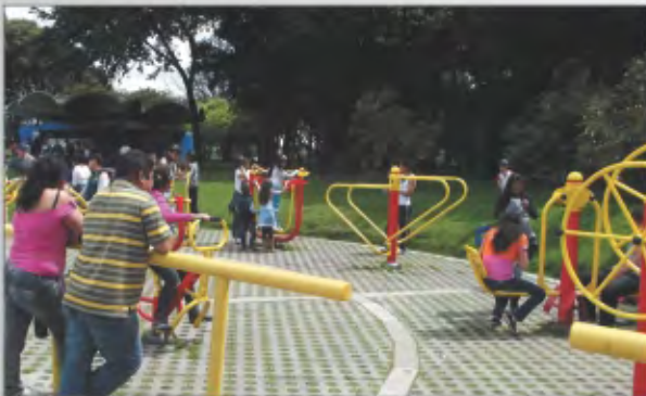
Kids play area