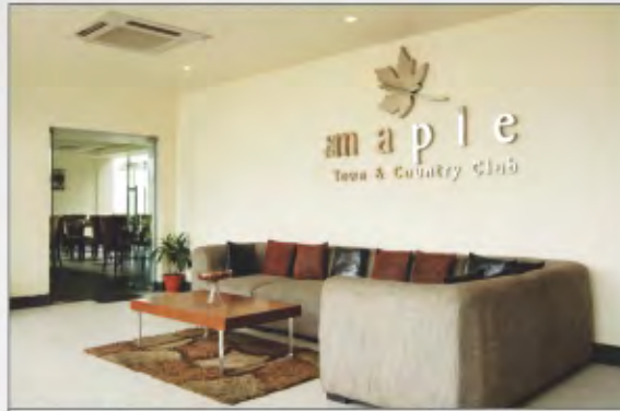
The Maple Town & Country Club