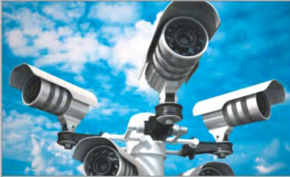
Round the clock security