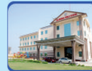
G.D. Goenka Public School Academic session started