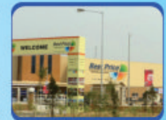
Bharti Walmart-Joint venture between Bharti & Walmart Operational