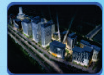
International Business Bay (under development)