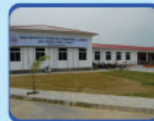
Ansal Institute of Technology & Management (A.I.T.M.)