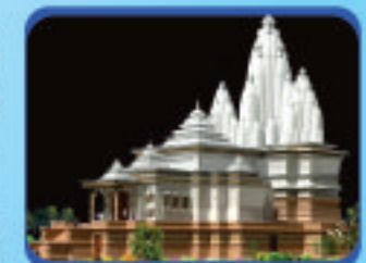
Ansal API ISKCON Spiritual Centre (under construction)