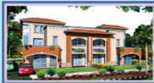
Palm Spring Villa