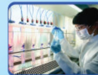
Bio-tech Park (proposed)