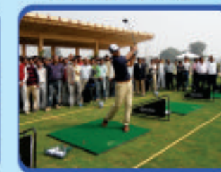
Golf Academy Operational