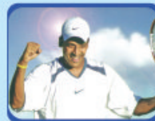
Mahesh Bhupati Tennis Academy