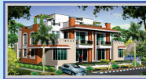
Palm Grove Villa