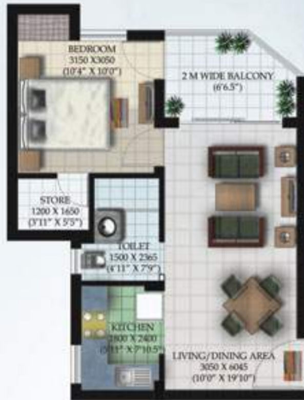
Unit Type A Sale Area - 760/770 Sq.Ft. 70.62/71.50 Sq. Mtr.