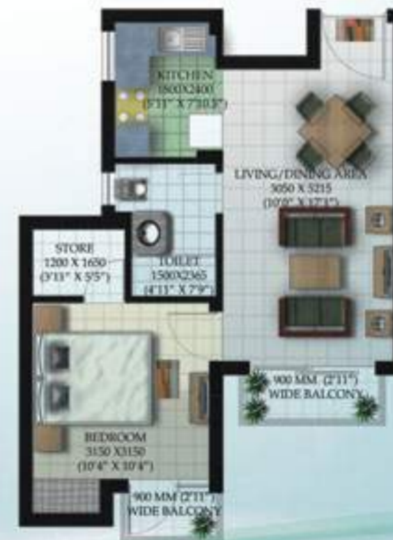
Unit Type D Sale Area - 722 Sq.Ft. 67.10 Sq. Mtr. (1st - 4th Floor)