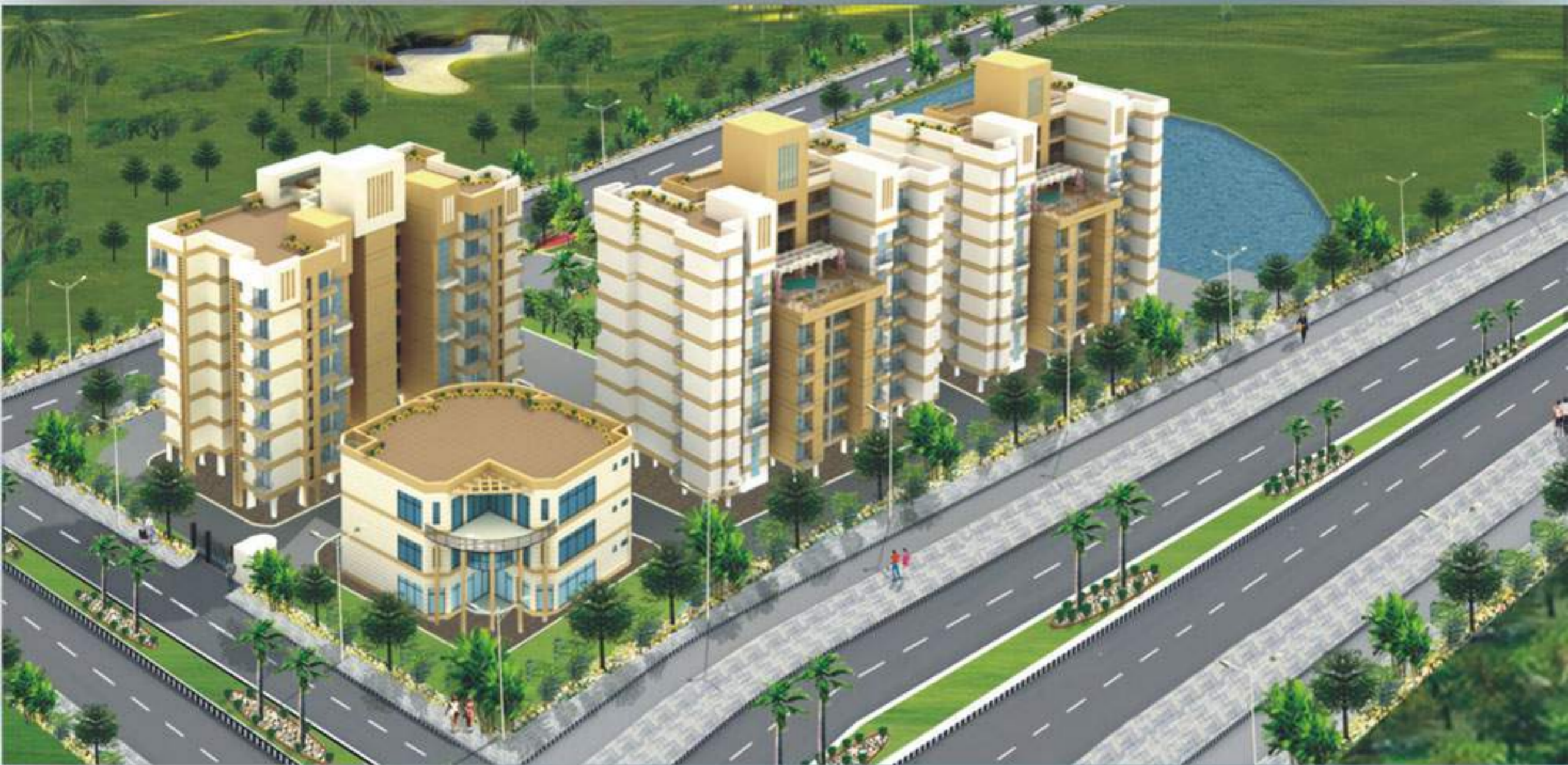
An artistic impression of Santushti Enclave - Bird's eye view.

Santushti Enclave is a prime offering by Ansal API for the senior citizens who wish to live even after having lived an eventful professional life. The Enclave is set to become a landmark as a property that has been exclusively created for them, designed keeping their every need in mind. Lush green landscapes reinvigorate facilities and amenities to let them live life, just the way they would love to, without worrying about anything in the world, including security and safety.