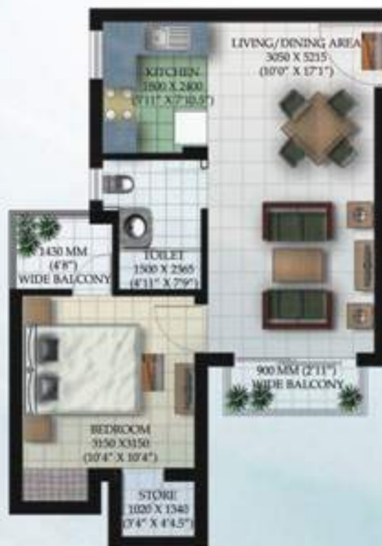
Unit Type C Sale Area - 750 Sq.Ft. 69.70 Sq. Mtr.