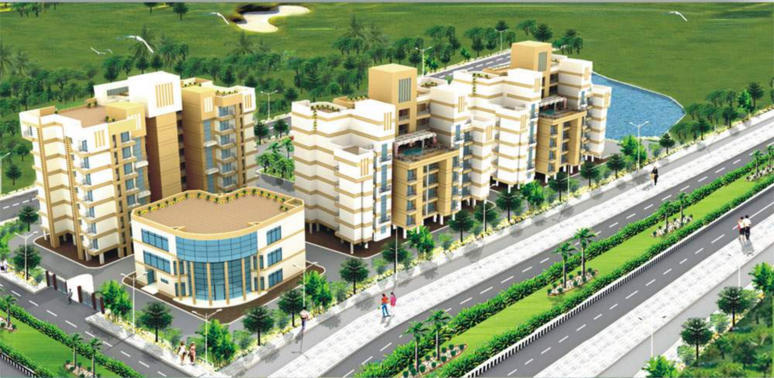
An artistic impression of Santushti Enclave - Bird's eye view.