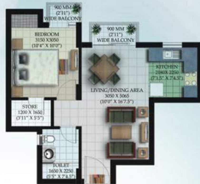
Unit Type B Sale Area - 758/795 Sq.Ft. 70.39/73.82 Sq. Mtr.