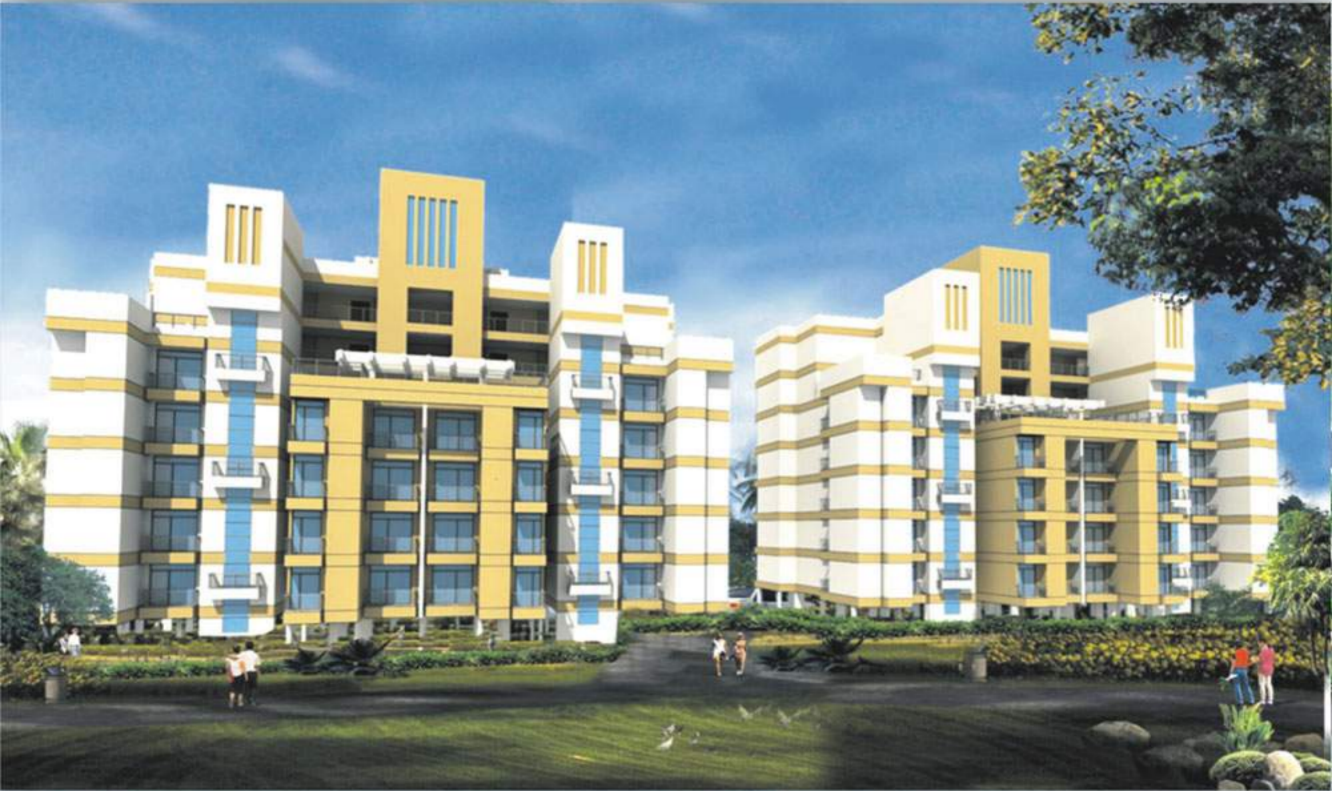
An artistic impression of Santushti Enclave - Gate View