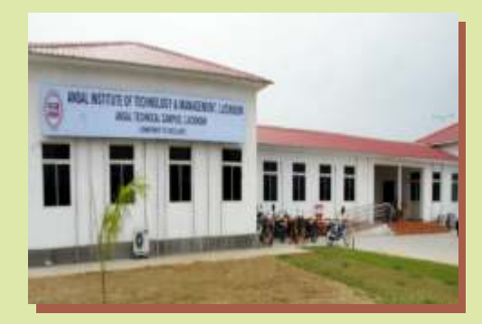
Ansal Institute of Technology & Management