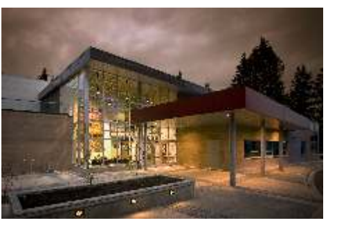
Club and Community Center

Imagine a lifestyle that ensures world class living ...everyday.