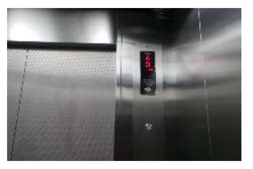
Generator back-up & Lift Facility*