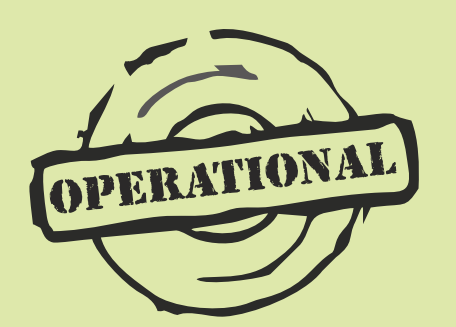
S. J International School