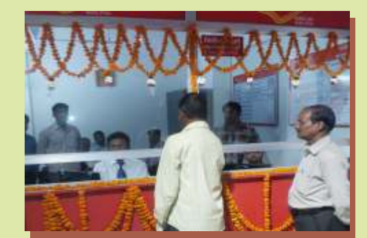
Sub Post Office