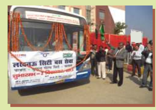
City Bus Service operational for Sushant Golf City