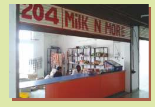
Milk 'n' More