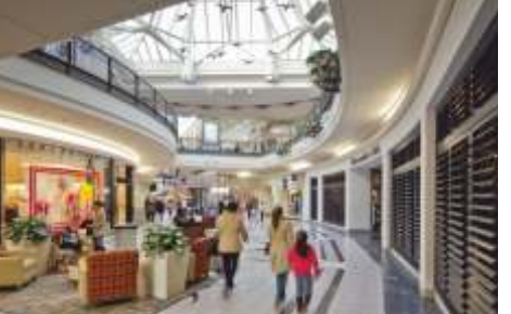
In Close Proximity of Commercial Complex