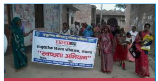
Cleaning Action campaign at village Jhiljhilapurwa to sensitise the community members on importance of clean surroundings